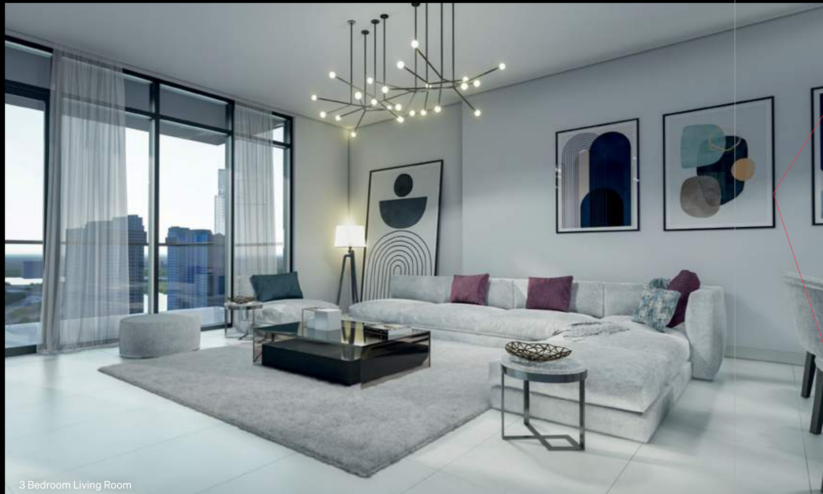
3 Bedroom Living Room