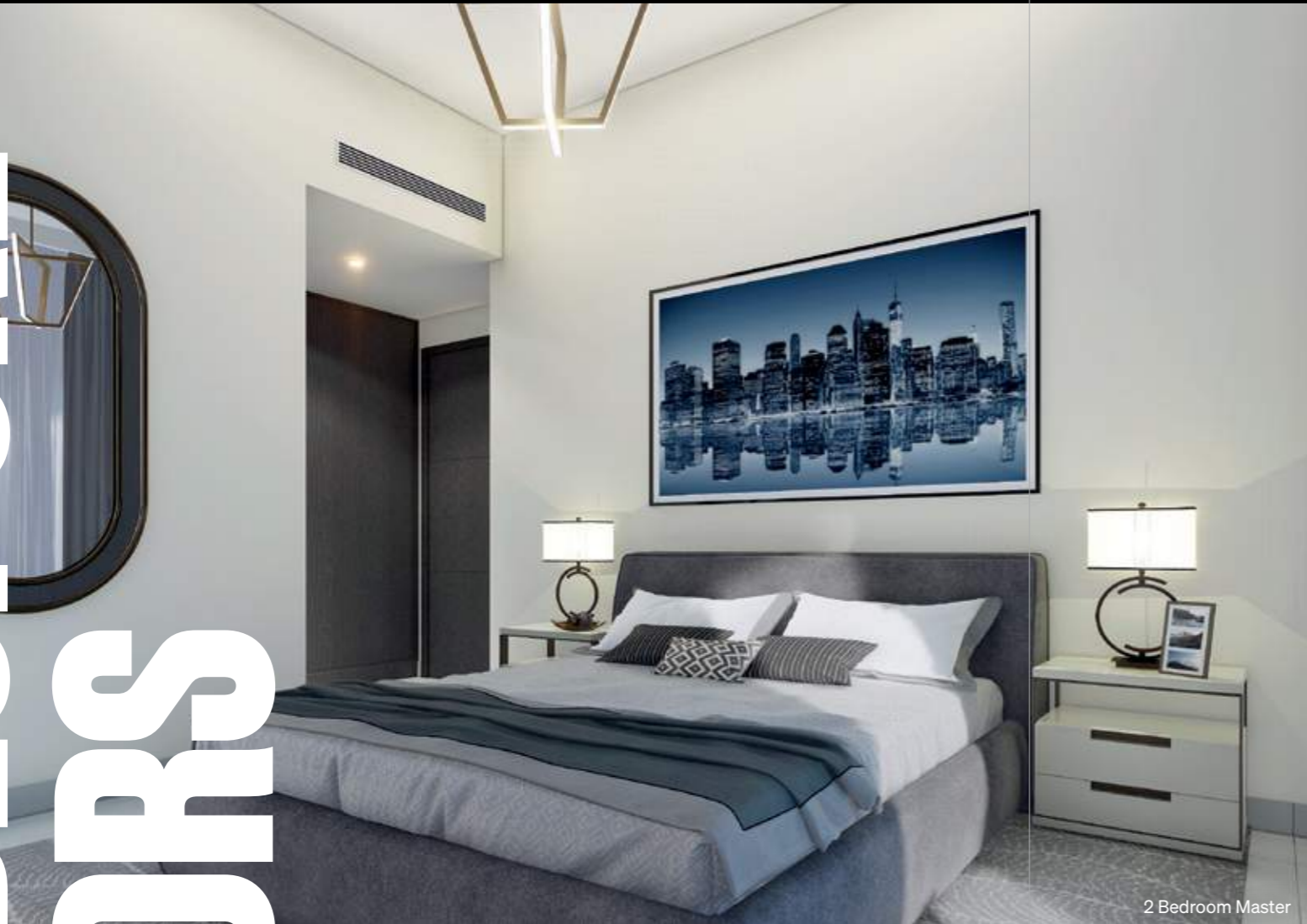
2 Bedroom Master

The Paragon apartments succeed in fusing an upmarket and stylish design with a harmonized and balanced atmosphere. Porcelain-tiled floors flow smoothly throughout each home, while European light fixtures are fitted within every room. Double glazed, floor to ceiling windows work functionally to keep out noise and heat, but also aesthetically to create a bright and open living space. The neutral color palette adds a touch of understated elegance or acts as the perfect base for owners to decorate to their own liking.