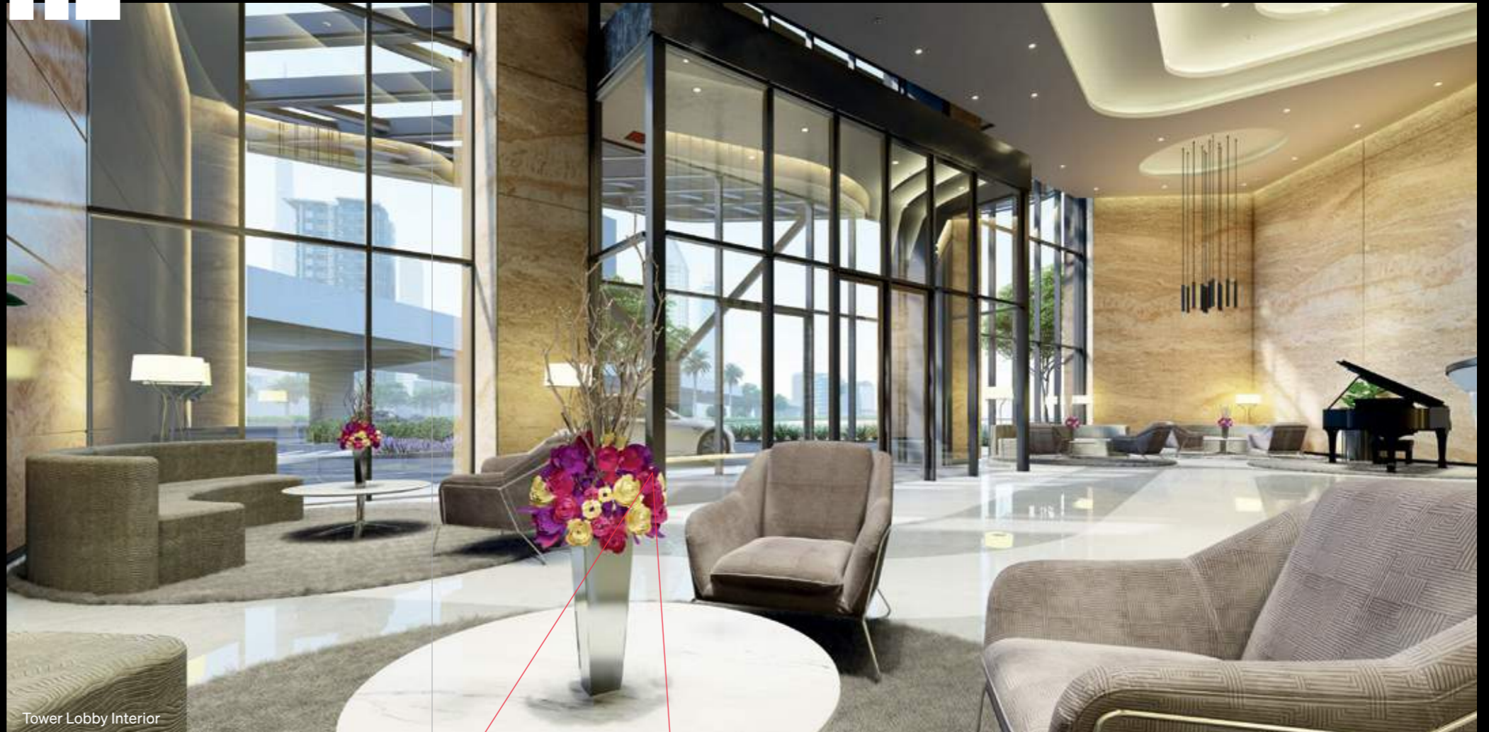
Tower Lobby Interior

THE PARAGON HAS AN EDGY URBAN ARCHITECTURAL DESIGN AND IS BUILT WITH THE HIGHEST QUALITY MATERIALS AND FINISHES, MAKING IT THE DEFINITION OF ULTIMATE SOPHISTICATION.