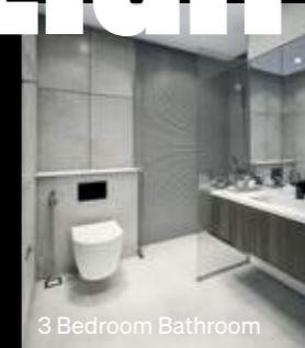
3 Bedroom Bathroom