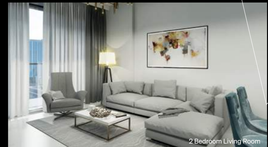
2 Bedroom Living Room