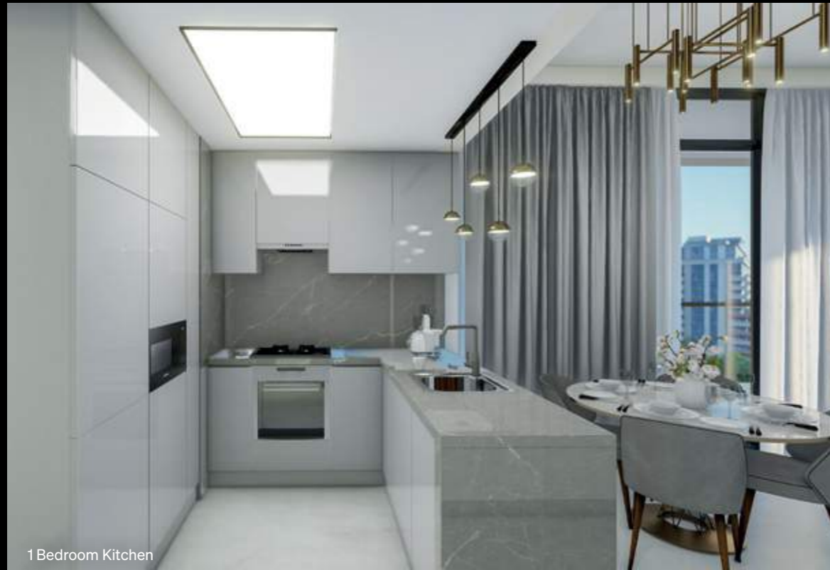
1 Bedroom Kitchen