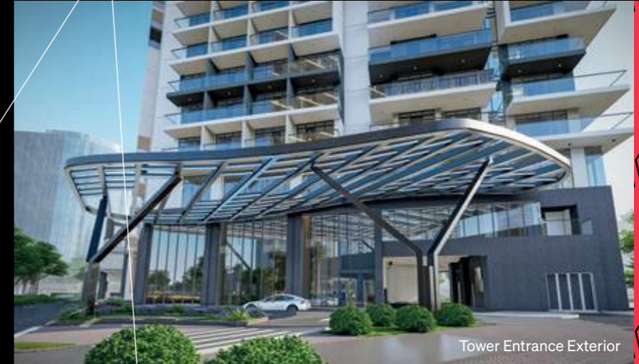
Tower Entrance Exterior