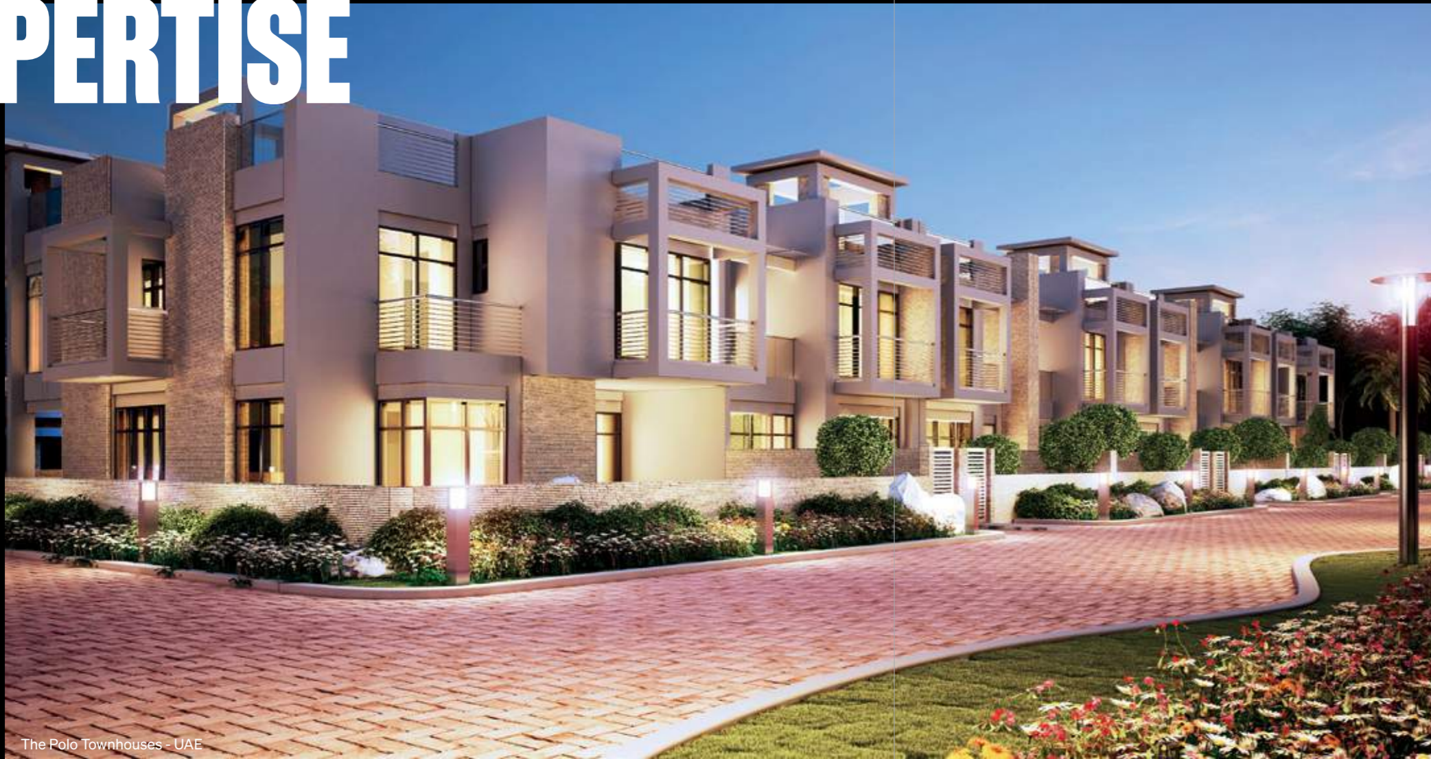
The Polo Townhouses - UAE