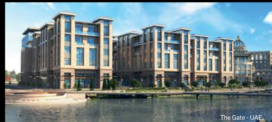
The Gate - UAE

Today, an expanded and impressive portfolio of premium properties, which includes some of the most sought-after properties by meticulous clients worldwide, serve as a testament to IGO's well-deserved reputation as one of the top regional investment companies.